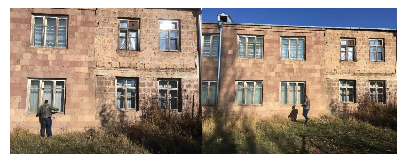
Demolition and cleaning of old windows